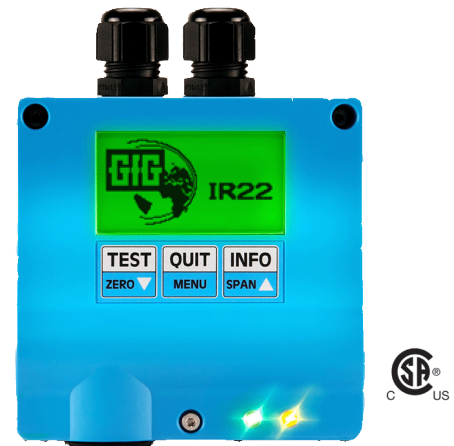
IR 22 CO 2 Gas Measurement Transmitter

Cannabis can be sold in the form of leaf or buds, but the most valuable products are essential oils and extracts. Extraction is the process of separating the active chemicals from the raw material, and turning it into a usable form. Medical extracts are mostly based on cannabidiol (CBD) while recreational extracts are based on tetrahydrocannabinol (THC). The most common extraction techniques involve the use of flammable gas or solvents to separate the chemicals from the plant material. Extraction rooms are hazardous locations where explosive concentrations of gas or vapor can easily develop.