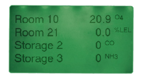
Display for quick and safe evaluation