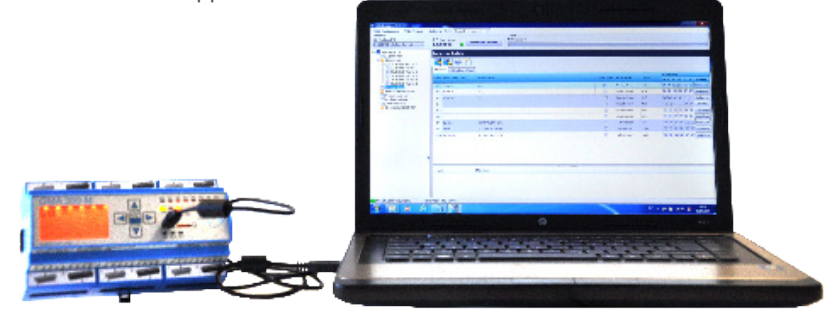
GMA 200-MT configuration via software