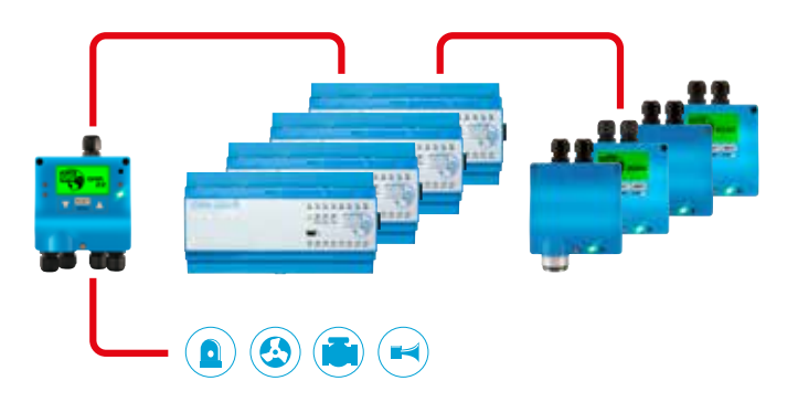
GMA22-MW maximum configuration

Even more flexibility is available with the option to address not only the transmitters but also up to 4 additional relay modules from the GMA200-RT or GMA200-RTD through the digital RS-485 interface.