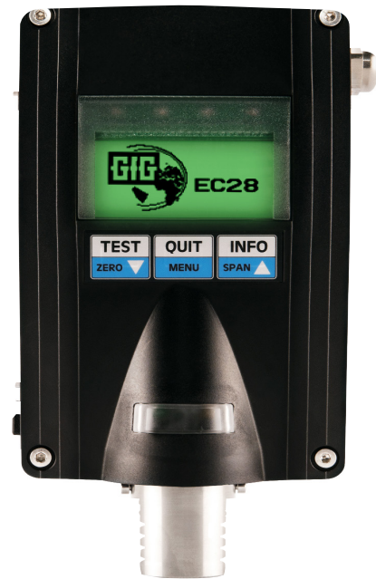
EC28 Di with display.

Due to its intrinsically safe build, the EC28 i / Di can be used even in areas with a particularly high risk of explosion. A Zener safety barrier has to be connected between the transmitter and the GfG controller to convert the supply voltage to 24 V DC. This prevents the power lines from igniting within the Ex zone. The intrinsic safety of the EC28 i / Di is ATEX-certified and makes it suitable for applications up to Ex zone 0.