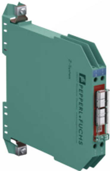
The DIN-rail mountable Zener Barrier for Ex zone areas.