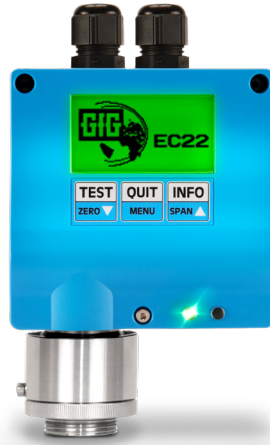
Analog version of the EC22 O with one cable entry and display