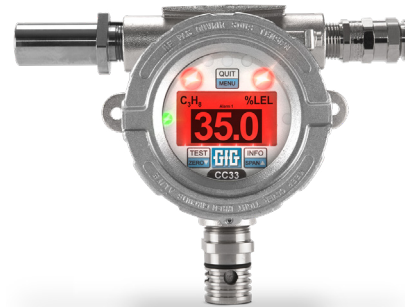
Unpainted stainless steel housing and explosion-proof buzzer

Also, in combination with GfG's powerful controllers, the CC33 is the right choice for monitoring flammable gases and vapors up to the lower explosion limit (LEL) as well as ammonia (% volume).