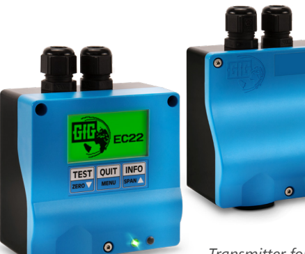
Transmitter for electrochemical sensors, EC22

Feel free to contact GfG anytime if you have question on how to protect your facility or plant in the best way from the hazards of hydrogen.