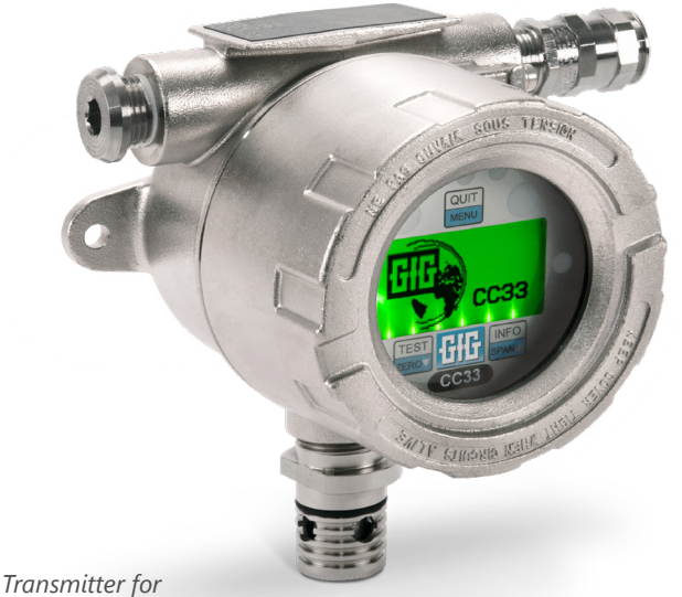
catalytic LEL sensors, CC33