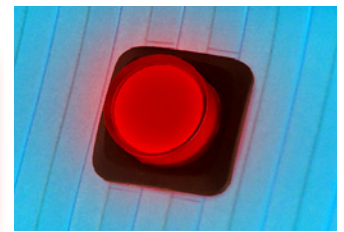
Push button manual alarm

Dependant on transmitter quantity and the connected alarm devices, bus cable lengths of up to 1200m are possible.