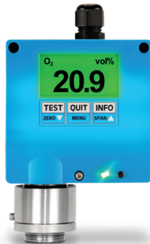
Analog version of the EC22 O with one cable entry and display