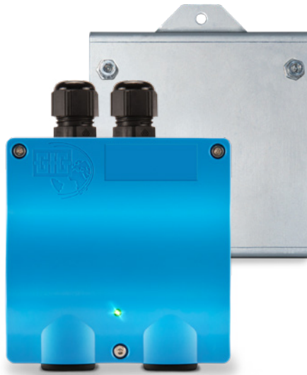
EC22 DS with suitable mounting plate

The EC22 DS dual sensor transmitter is designed to provide reliable and cost effective monitoring of these gases. Depending on the expected pollution of the ambient air, it is available in the sensor combinations CO/NO and CO/NO 2 .