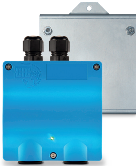
EC22 DS with suitable mounting plate

The EC22 DS dual sensor transmitter is designed to provide reliable and cost effective monitoring of these gases. Depending on the expected pollution of the ambient air, it is available in the sensor combinations CO/NO and CO/NO 2 .