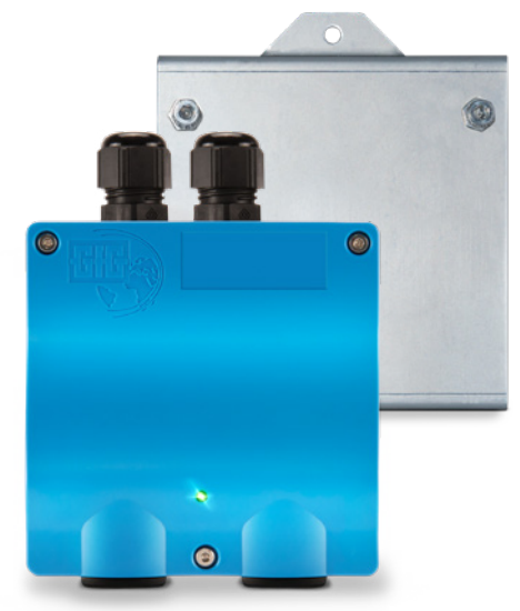
EC22 DS with suitable mounting plate

The electronics of the transmitter takes over the stabilization of the voltage, the transmission of the measured values and the detection of faults already at the measuring point. Thanks to the integrated temperature compensation, the highest measurement accuracy is is guaranteed.