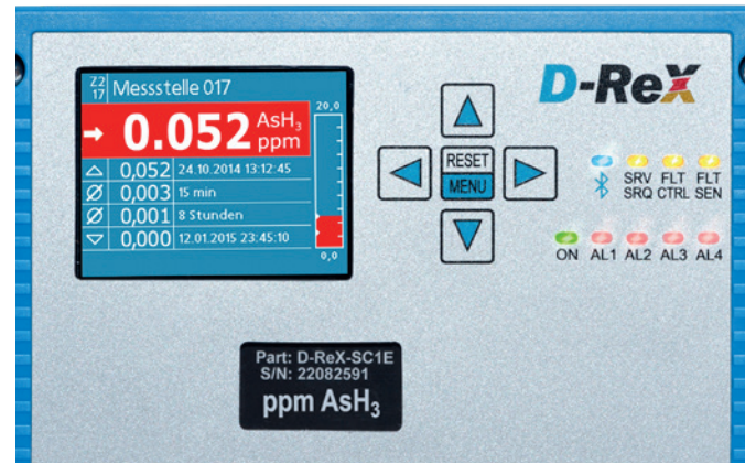
User interface with display, control keys and status LEDs

The plug-and-play smart sensor cartridges are pre-configured and pre-calibrated for easy installation or replacement. Automatic sensor self-tests increase safety while reducing maintenance costs even further.