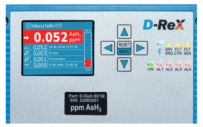
User interface with display, control keys and status LEDs

The plug-and-play smart sensor cartridges are pre-configured and pre-calibrated for easy installation or replacement. Automatic sensor self-tests increase safety while reducing maintenance costs even further.