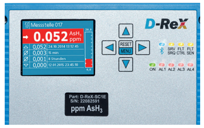
User interface with display, control keys and status LEDs

The plug-and-play smart sensor cartridges are pre-configured and pre-calibrated for easy installation or replacement. Automatic sensor self-tests increase safety while reducing maintenance costs even further.