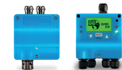
CC22 ex and GMA22-M controller