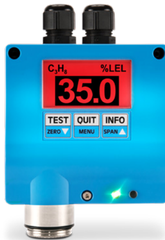
Visual display and alarm

The D version of the CC22 has a 2.2" display to show measured values, status information and alarms at the measuring point. Normally backlit in green, the display changes for visual alert to red in the event of an alarm. At the same time, an acoustic alarm signal will be emitted by the integrated horn.