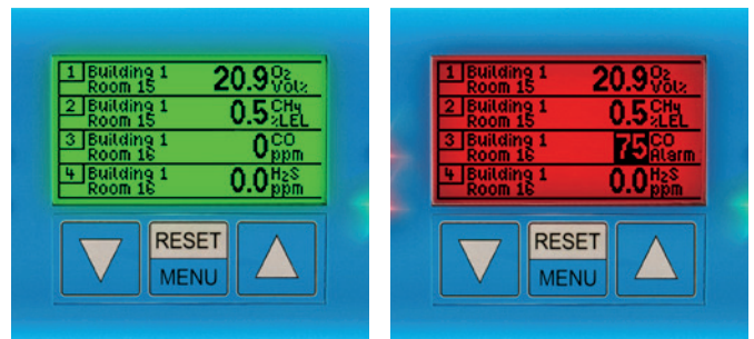
Measured value overview in normal or alarm state

The current measured values of all transmitters are continuously displayed on the 2.2" LCD. The operating status is indicated by the status LEDs. In normal operation, only the green LED is lit. A yellow LED indicates malfunctions or service work. In the event of an alarm, the background color of the display changes from green to red and only the measured values of the measuring points at which the limit values were exceeded or fallen below are displayed. Red LEDs indicate the alarm level. In addition, an acoustic warning signal sounds.