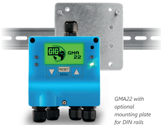
GMA22 with optional mounting plate for DIN rails

Even more flexibility results from the option to address not only the transmitters but also up to 4 additional relay modules of type GMA200-RT or GMA200-RTD via the digital RS485 interface.