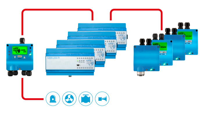
GMA22 maximum configuration

Even more flexibility results from the option to address not only the transmitters but also up to 4 additional relay modules of type GMA200-RT or GMA200-RTD via the digital RS485 interface.