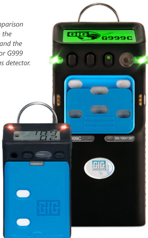
Size comparison between the Micro 5 and the Polytor G999 multi-gas detector.

« Certified for use in underground operations. »